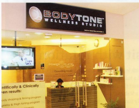
The Bodytone Wellness Studio in the Klang Valley is located in Bangsar Village II

Bodytone Wellness Studio is located at second floor, Bangsar Village II, Kuala Lumpur. For more information, call 03-2284 8011.